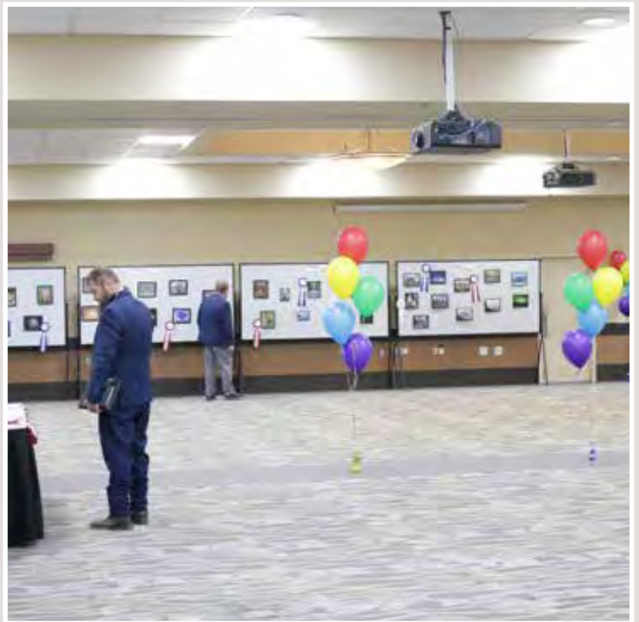
Delegates and guests previewing the art work of students.