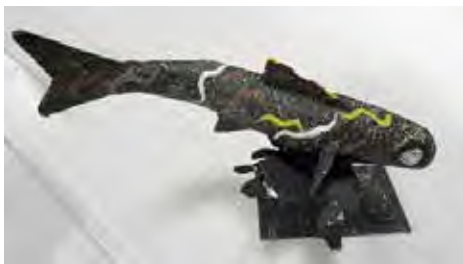
1 ST GABRILLE COLOMB-DUMAS, West Lynn Heights School, "Untitled"