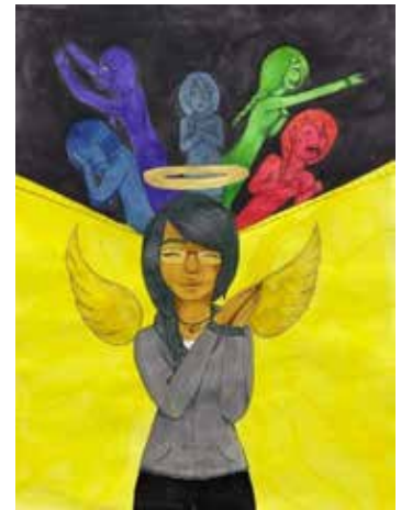
3 RD AVRYL BEARDY, Frontier Collegiate, "See My Heart"