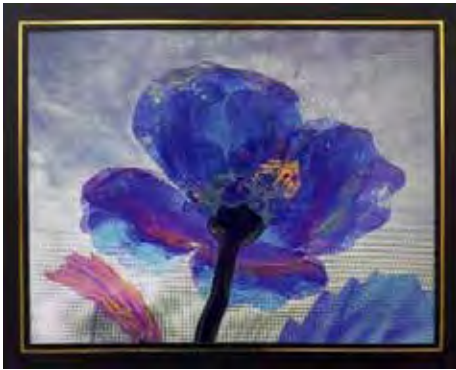
1 ST LEONNA SUMNER, Dauphin River School, "Exotic Flower on a Screen"