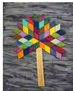
3 RD MADDEN DA MATA, Falcon Beach School, "Tree of Frontier"