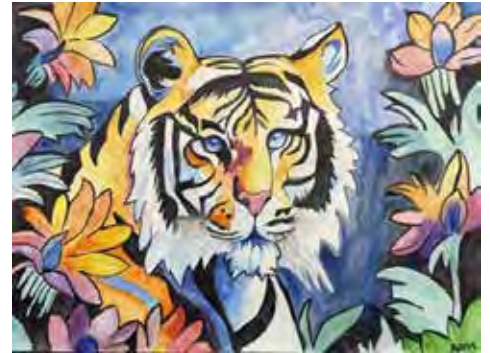
3 RD KARIS BIGHETTY, Frontier Collegiate, "Tiger"