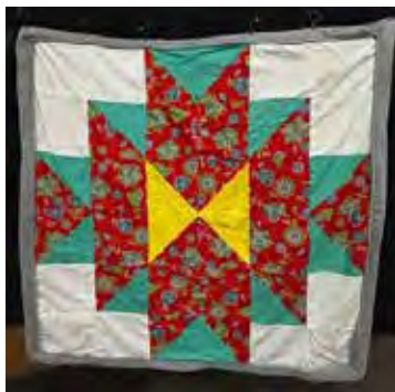
1 ST EMMERSYN DA MATA, Falcon Beach School, "Passion Blooms"