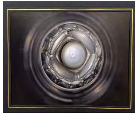
2 ND LES SIMPSON, Minegoziibe Anishinabe School, "Black Hole"