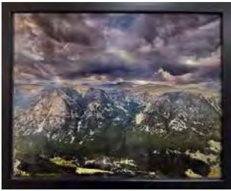
1 ST GRAYDEN SIE-MERRITT, Falcon Beach School, "The Storm"