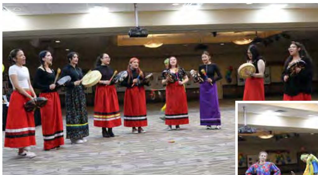
The Deadly Aunties Drum Group performance.