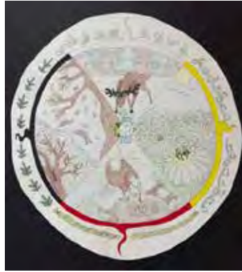
2 ND IVAN TURNER, Frontier Collegiate, "Medicine Wheel"