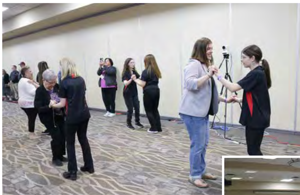
Delegates enjoying the Frontier Fiddlers performance including dance lessons.