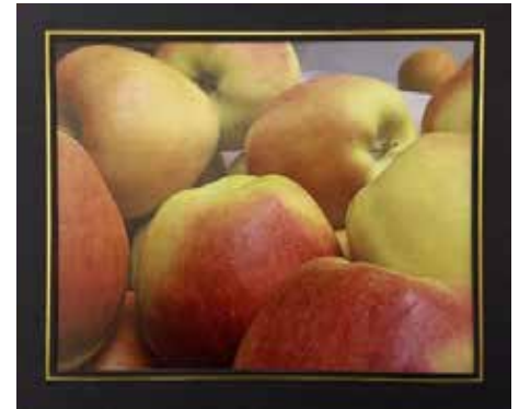
3 RD LOWEN NEPINAK, Skownan School, "Apples"