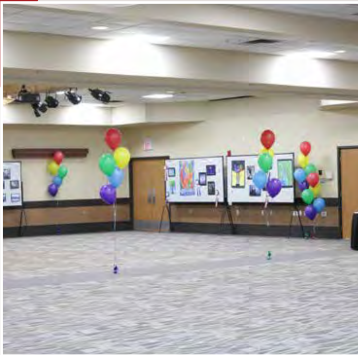
Juried Art Show room final set-up as we prepare for delegate viewing.