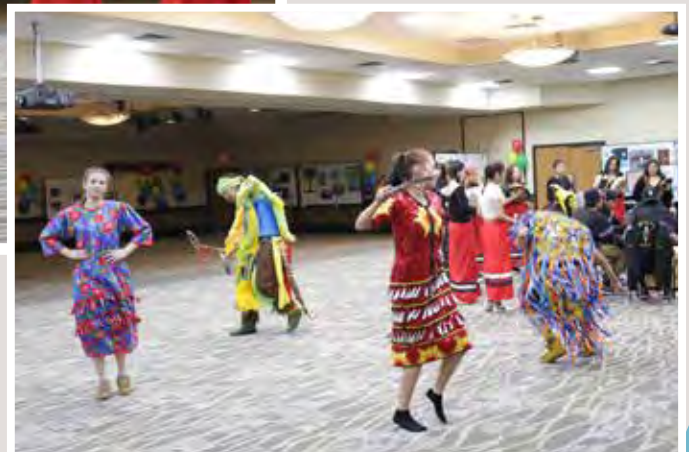
Conference Opening and Celebration welcome included various dance performances.