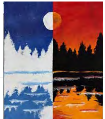
3 RD EDMOUND BEARDY, Thicket Portage School, "The Barren Grounds"