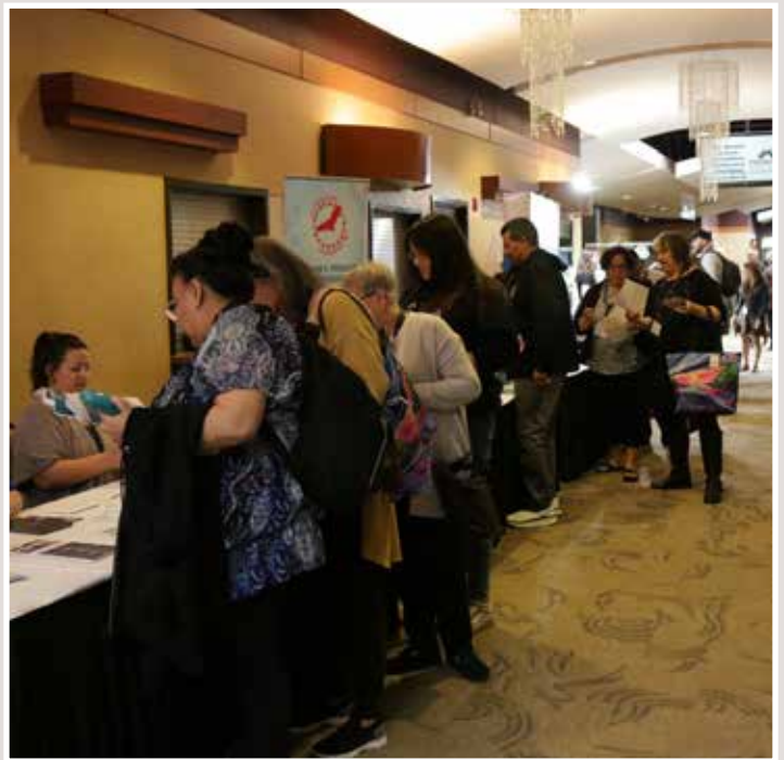
Delegates visiting the Program and Partner display booths.